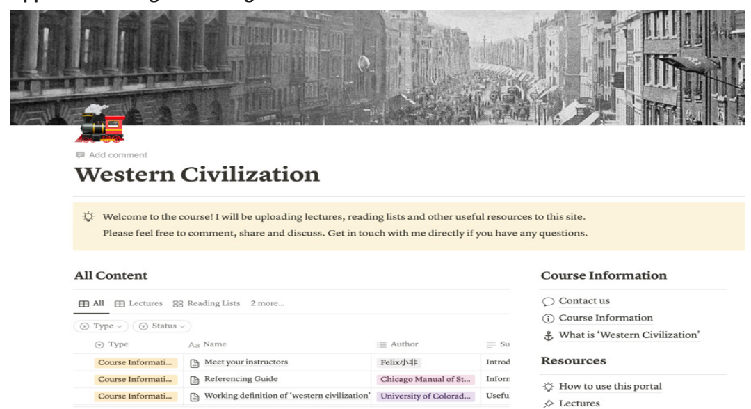
Figure 1: Online Platform Landing Page (desktop view)